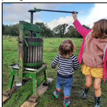
▶ Children trying their hands at apple pressing in one of the orchards in the Country Park.