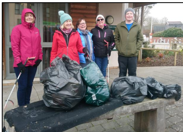
▲ Some of our litter-picking volunteers in action.

The Town Council celebrates the Citizen Award in recognition of outstanding local achievements every year. Congratulations to the well-deserving winner!