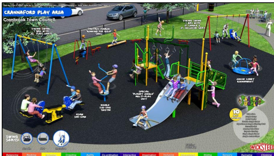
▲ The final design of the new Crannaforde play area in Rush Meadow Road which will be installed during 2022.