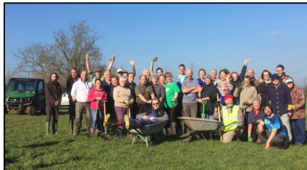
▲ Some of our fantastic volunteers at a tree-planting event. During 2021-22 we planted approximately 500 trees and we are planning to multiply that number in years to come in addition to implementing a verge replanting programme to enhance urban biodiversity in many neighbourhoods.

Litter picking and bin emptying away from the adopted Main Local Route (MLR) Youth service provided by our service provider Youth Genesis Community development work