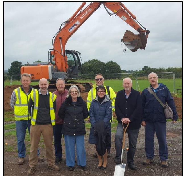
▲ More turf cutting in September 2022 – this time marking the beginning of the construction of the Ingrams Sports Pavilion on 30 September 2022. The Town Council is delivering the Pavilion from Section 106 funding, a contribution from Sport England and £301,750 from its own general reserves.