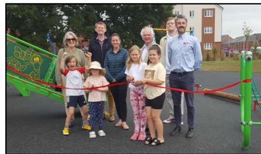
◀ Opening of the Crannaforde play area in Rush Meadow Road on 22 August 2022. In 2022-23, the Town Council opened two new play areas.