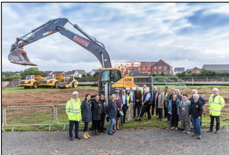
▲ Turf cutting marking the beginning of the construction of the town centre in Cranbrook on 29 September 2022 – a much anticipated milestone.

After our previous youth service provider since 2017, Youth Genesis, terminated our contract without notice in late August 2022, two resident volunteers established the Cranbrook Youth Club CIC which delivers a service for young people in the Younghayes Centre each Tuesday evening during term time. We are hoping to expand that service during 2023-24 so that even more young people can benefit from the inspirational team of youth workers. A huge thank you to everyone at the Cranbrook Youth Club CIC.