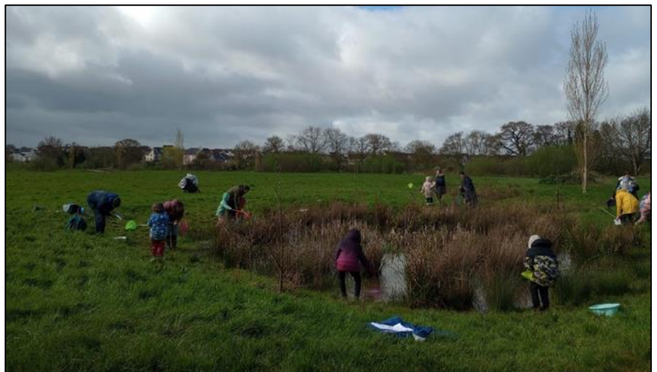
▲ Pond dipping in the Country Park; the young explorers had a blast discovering the fascinating creatures living beneath the surface of the pond.

Should you need to get in contact with Andy please email ranger@cranbrooktowncouncil.gov.uk .